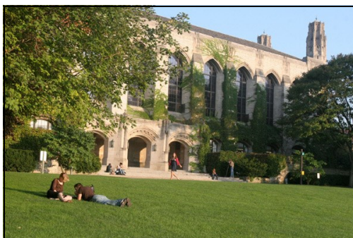
Students take a break in front of Northwestern University Library (left)

Visit us online! www.kellogg.northwestern.edu/programs/doctoralprogram