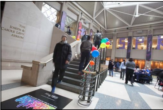
Students walk through the Atrium in the Jacobs Center during Mosaic Week, Kellogg's annual culture and diversity celebration.

The Jacobs Center, which houses the Kellogg School, is also home to the Economics Department, so students are at the heart of the Economics community on campus. Additionally, the Jacobs Center is close to the Departments of Psychology, Sociology, Mathematics, and Engineering.