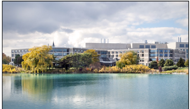
A view of the James L. Allen Center, Kellogg's Executive Education and Conference Center, from The Lakefill, Northwestern's 74-acre peninsula on Lake Michigan.

Northwestern University Library is one of the largest university libraries in the United States, and it is 10th in holdings among US private universities. It has more than 5.4 million volumes and 94,163 current periodicals and serials, more than 700 databases – more than 90% accessible electronically and 6,000 electronic journals. More than 73,000 e-books were added to the Library's collection in 2010, and there are 22 terabytes of unique digital content (NUL). Other libraries on the Evanston campus often used by Kellogg students are the Mathematics Library and the Seeley G. Mudd Science and Engineering Library. Students also have access to other excellent libraries in the Chicago area through the Reference Department and to specialized materials throughout the world through the Interlibrary Loan Department.