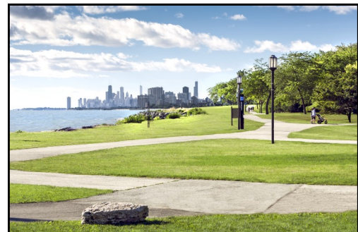
A view of Chicago's skyline from the Evanston Campus

Kellogg also has a campus in Miami (Kellogg-Miami Campus) that combines the resources of a top-ranked business school with the convenience of being located in the financial center of the southeastern United States and the gateway to Latin America.